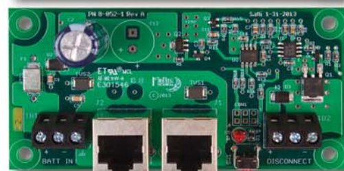
Battery Disconnect Module (MNBDM)