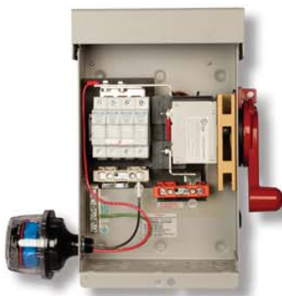
MNPVHV4 Basic 3R not shown