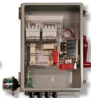
MNPVHV8 3R not shown