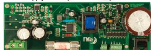
Power Supply Board (MNDiscoPSB)

SMA requested that MidNite Solar design and build Combiners that will be compatible with their TL series inverters. These DLTL combiners preserve SMA's unique emergency power back up feature during grid failure. The MNPVHV8-DLTL-3R, MNPVHV8-DLTL-4X and MNPVHV16-DLTL-4X are specifically designed for the new dual channel MPPT transformer-less inverters with an AC outlet that can be powered during a utility outage. The two MNPVHV8 DLTLs have four strings entering the combiner with 2 separate strings out while the MNPVHV16 has eight strings entering and two strings out.